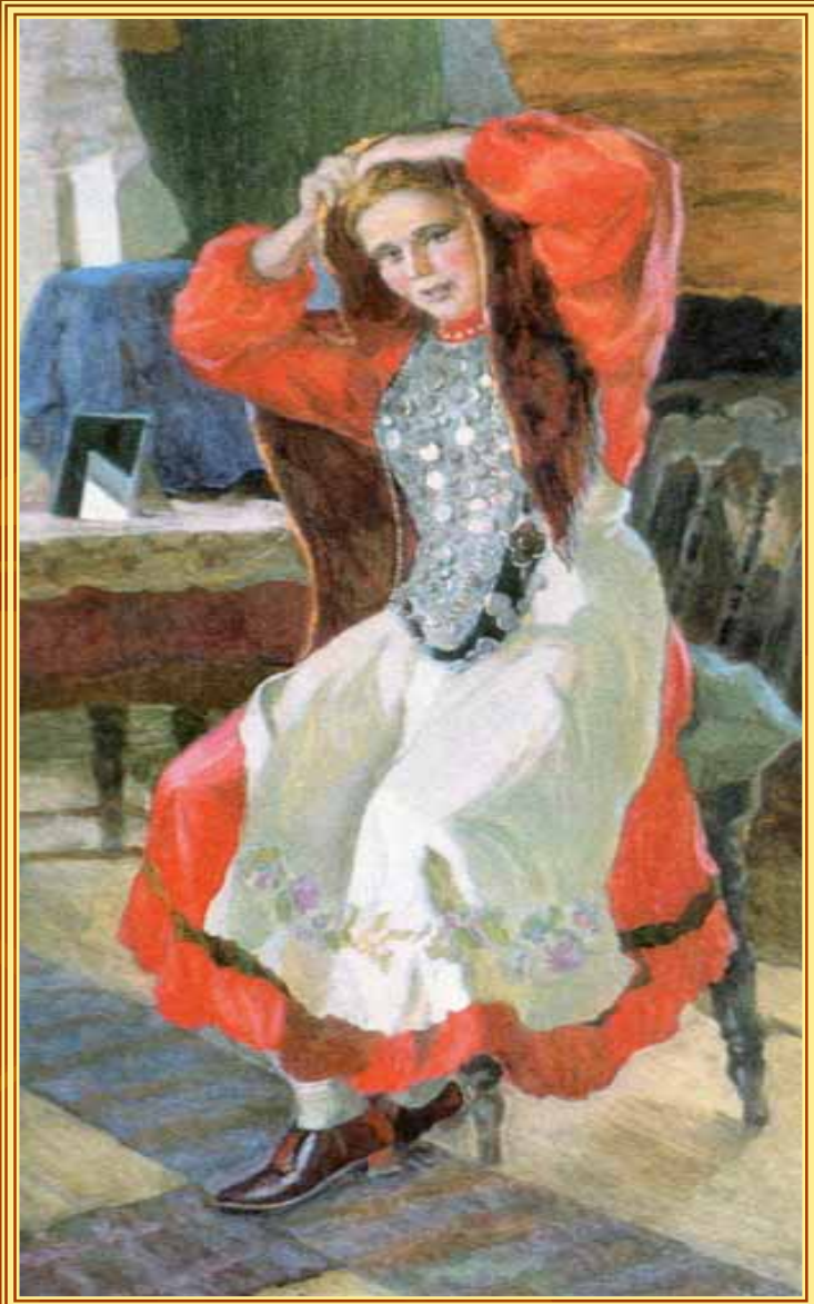
1959. "The young lady is in front of a mirror."