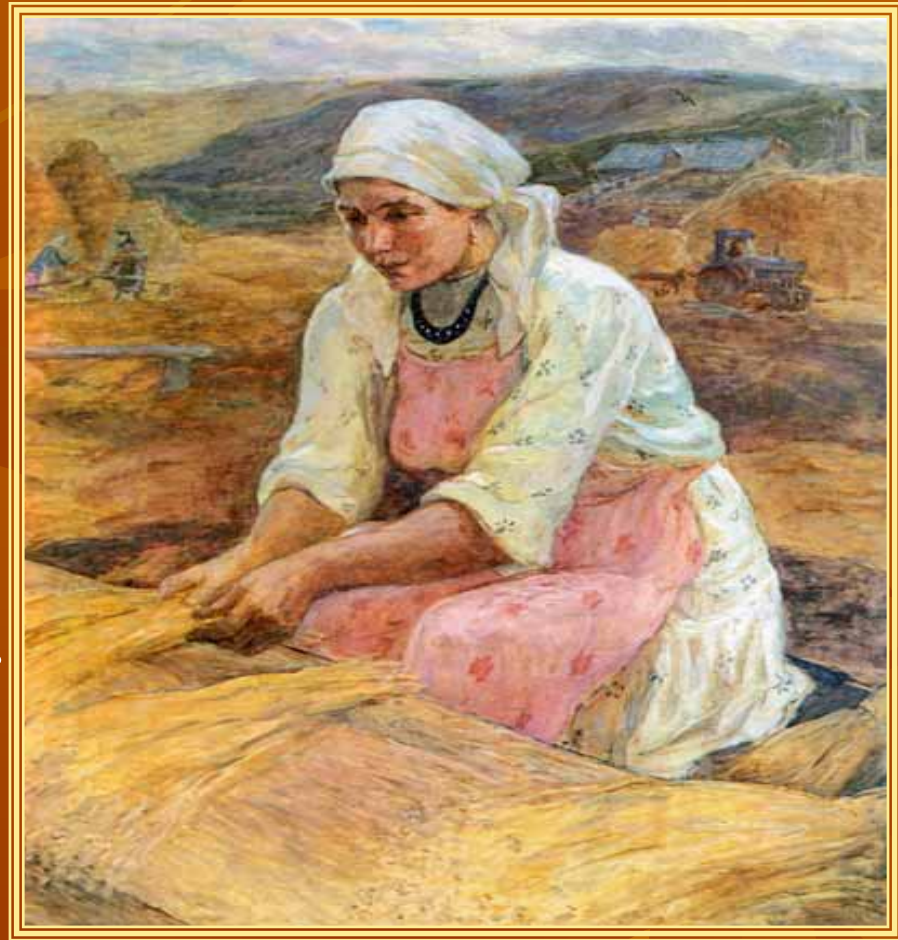
Udmurtian flax. Oil 1985

S. Vinogradov tried to reproduce the romantic character of labour in our country. Like other Udmurt artists Vinogradov shared a few common features That are typical for their creative activity. He strive to disclose a composite image of creative labour.