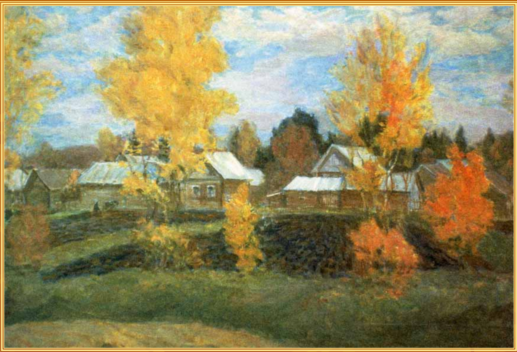
1983. My native village.