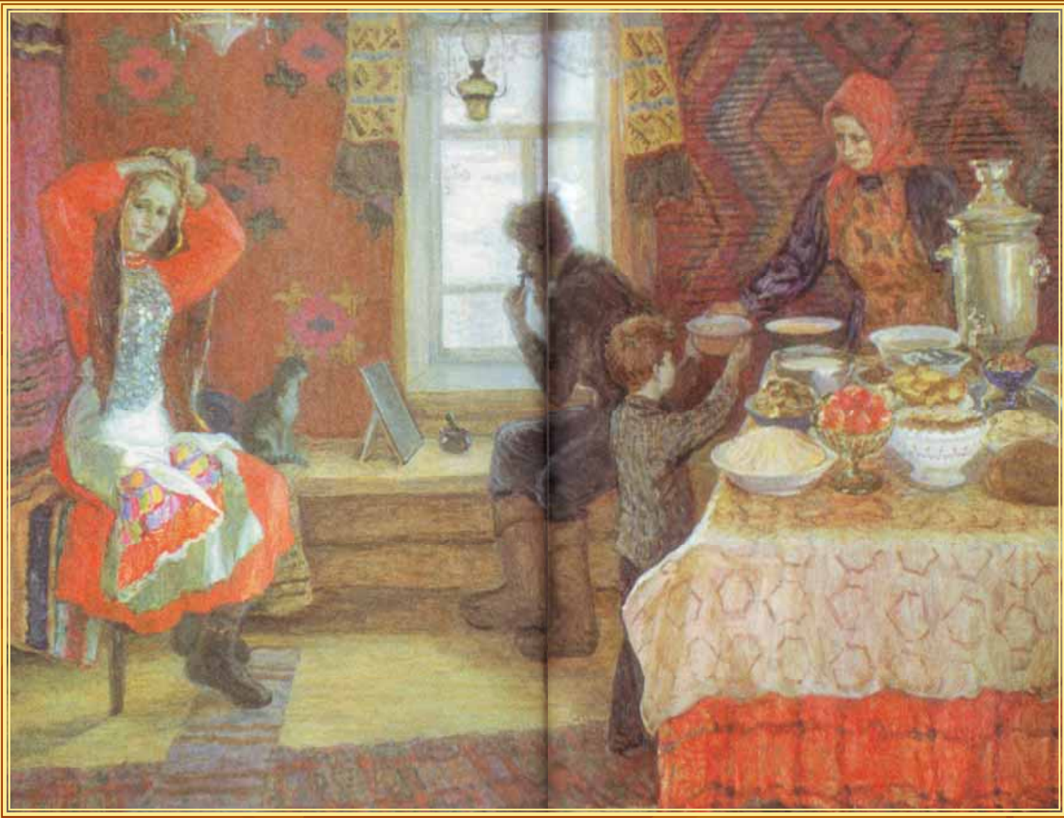
1983. A festival morning.