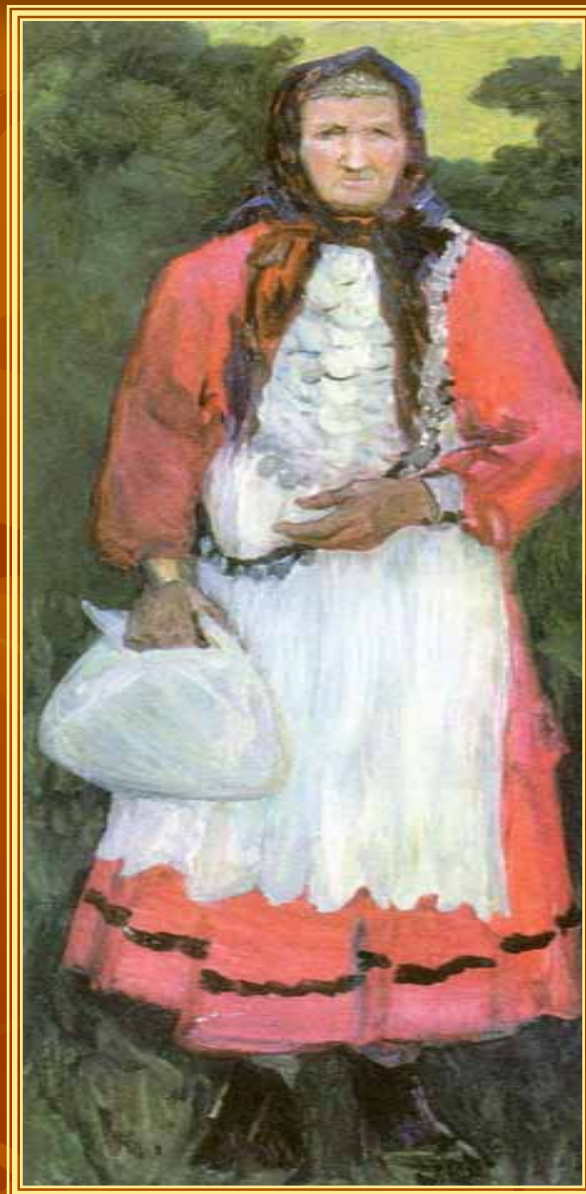
1960. To relatives