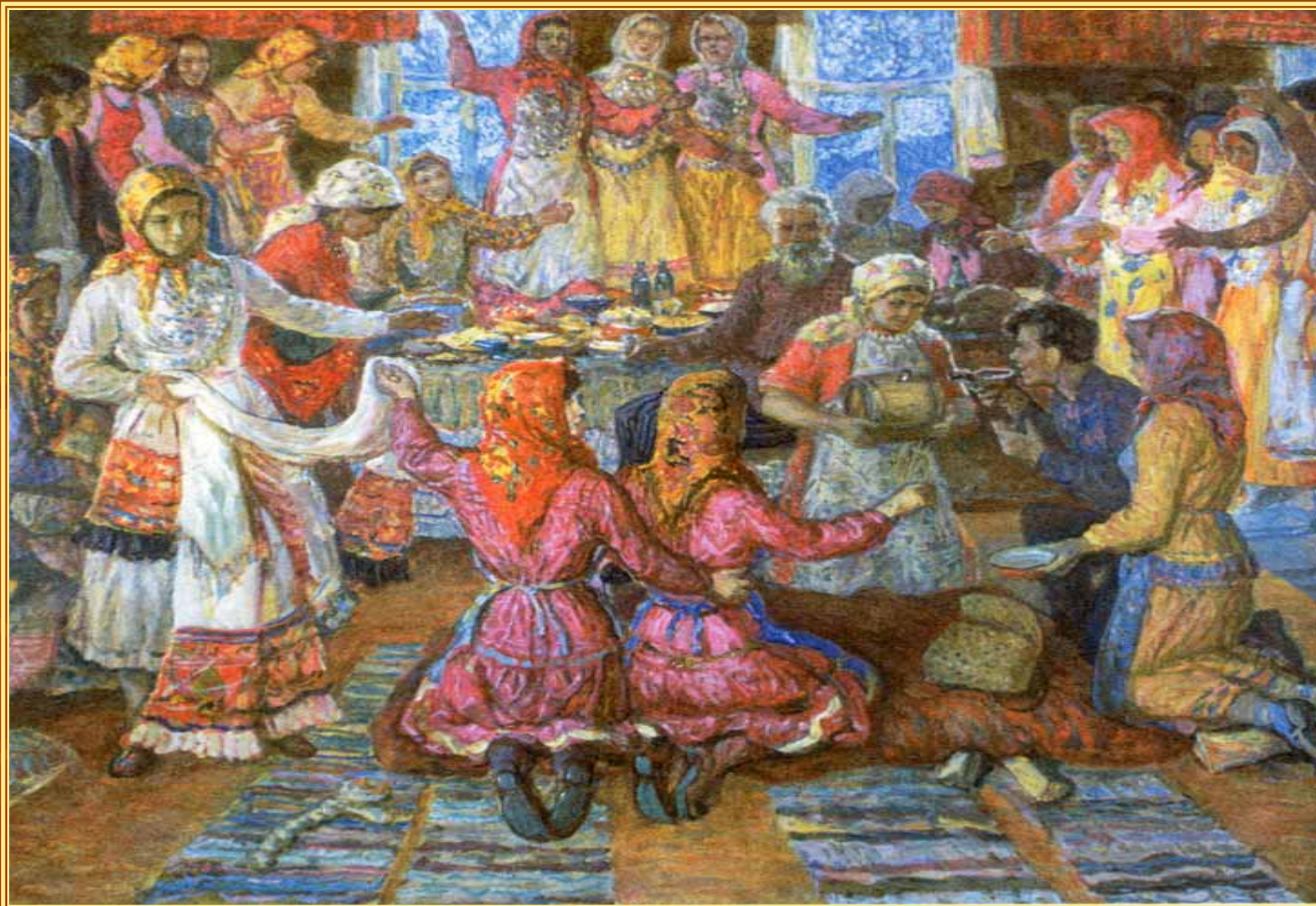
1983. An Udmurt wedding. Oil on canvas.