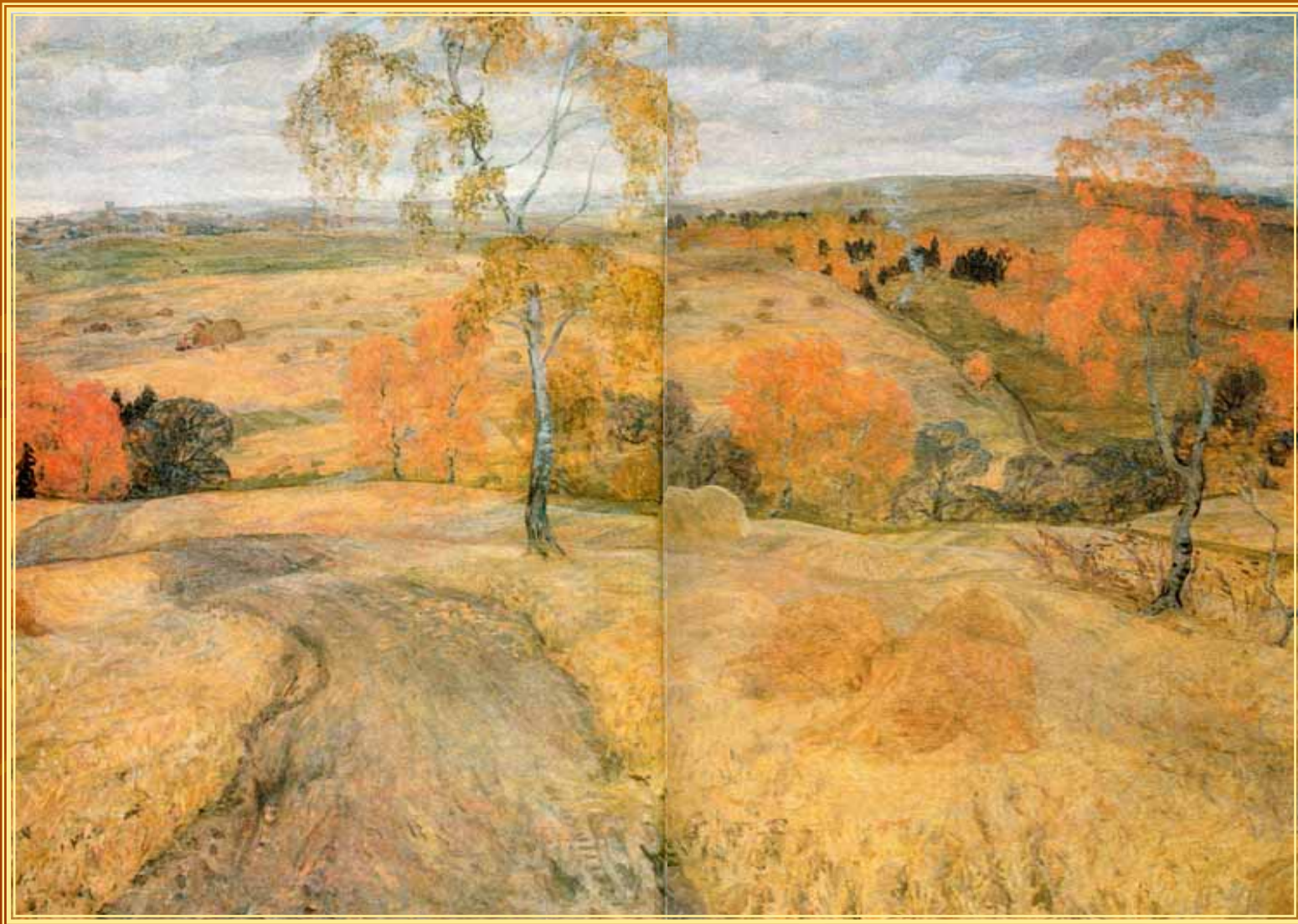
1971. An autumn in Udmurtia.