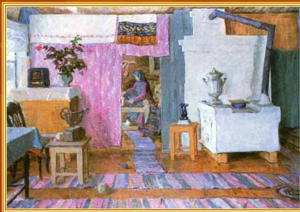
1970. "The native home". Oil.

All these things inspired him to create unforgettable pictures. You see a light clean room. There are bright handmade carpets on the floor and on the walls. There are white curtains on the window. There are a lot of flowers on the windowsills. There is a weaving loom behind the colourful bright curtain. A pleasant hardworking woman is weaving. The picture is full of a peaceful atmosphere. This creation has a true impression of the sitter. Using pink light orange blue colour enables him to portray and create harmony. This picture was displayed in a lot of exhibitions. The painting became a visiting card of Udmurtian's art.