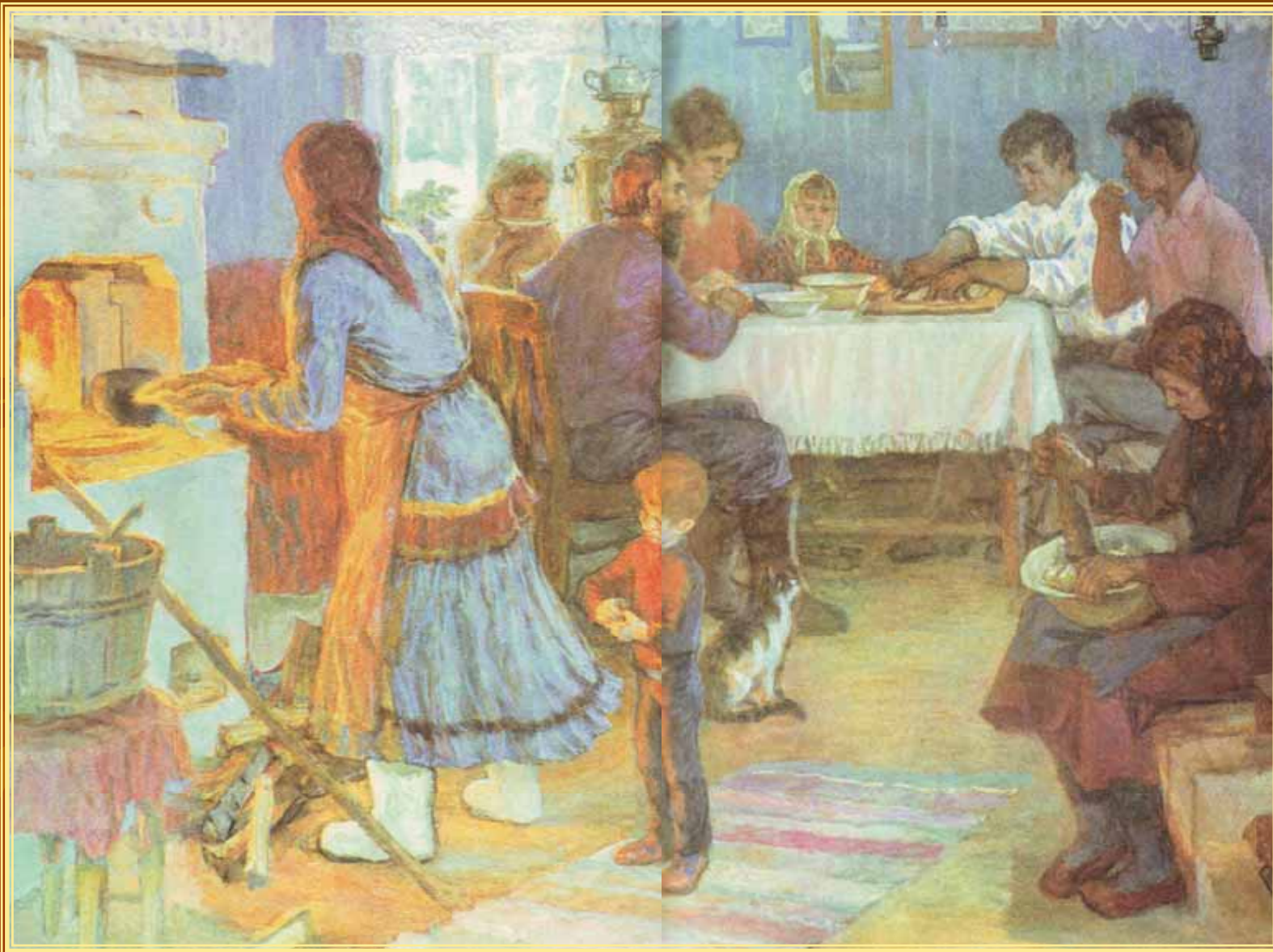
1978. "Tabani". Oil on canvas.