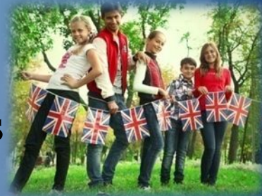
Spring and Late Summer Bank Holidays

Scottish people consider the New Year's Day to be also a public holiday.